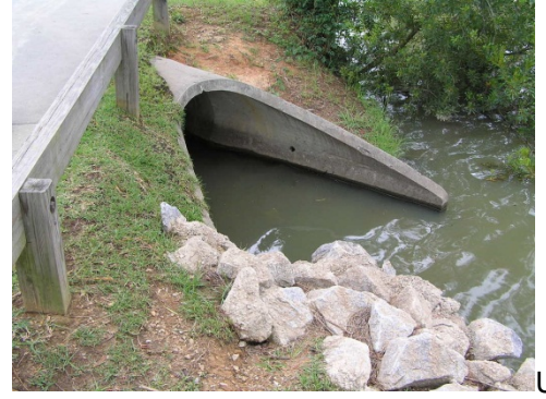
Use Pipe Flared End Section when specified in the plans or special provisions.

Use Pipe End Structure (719-615-00) when specified in the plans or special provisions. Use pipe end structure in locations where pipe exposed end faces the direction of traffic. Pipe end structures may be used in other locations if approved by the RCE.