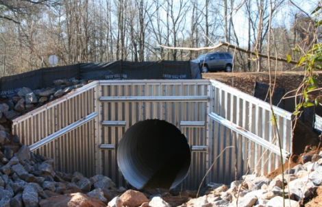
Jse Pipe Wingwall